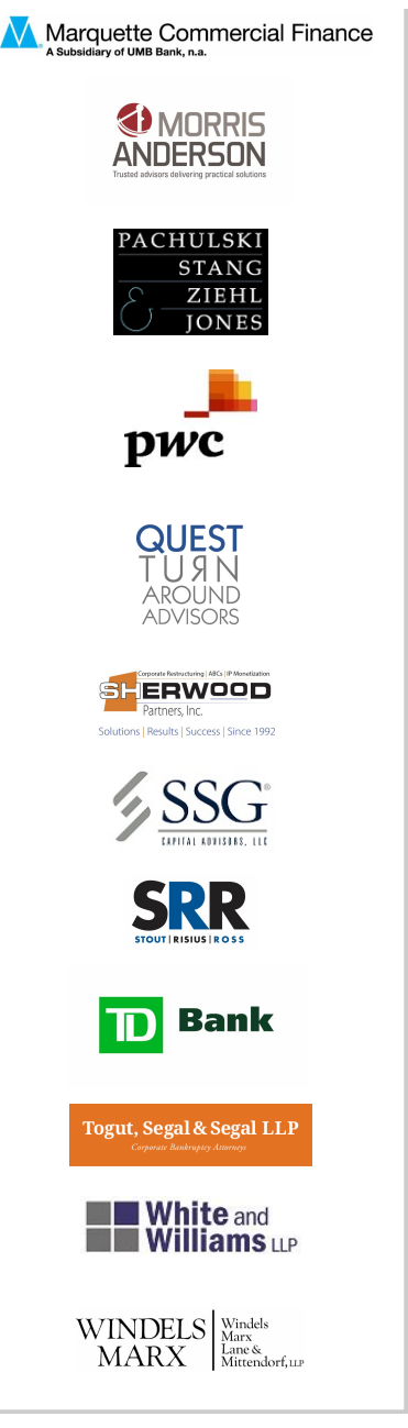
The Turnaround Management Association (TMA) is the premier organization dedicated to corporate renewal and turnaround management. Established in 1988, TMA has more than 8300 members in 55 chapters around the world.

newyorkchapter@turnaround.org (646) 932-5532