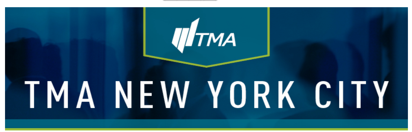
Friday - January 4, 2019